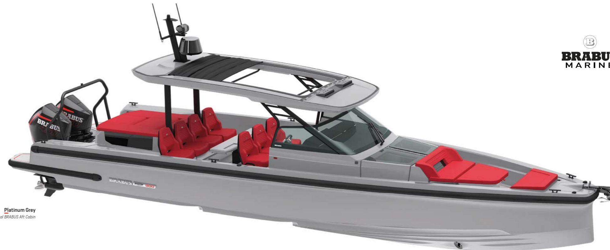
Platinum Grey Optional BRABUS Aft Cabin