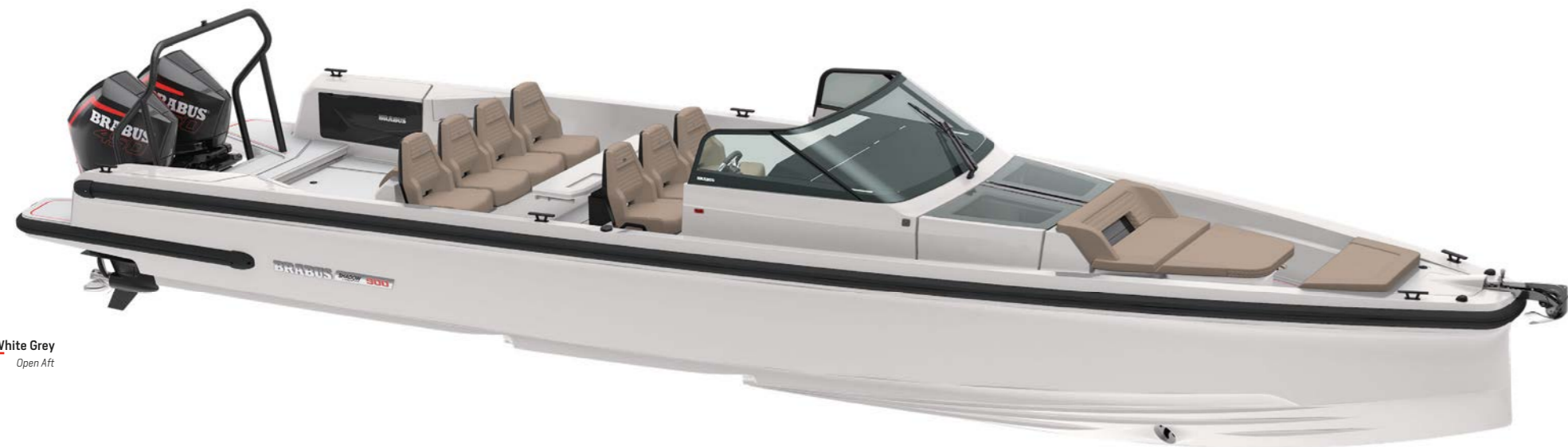
White Grey Open Aft